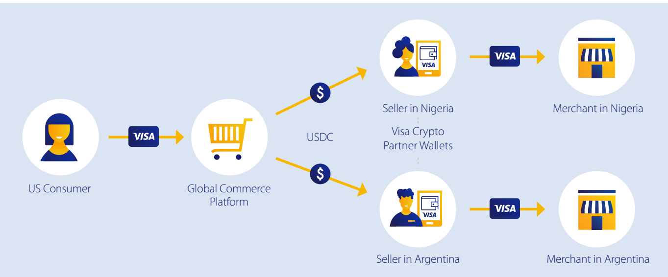
Figure 2: New Digital Currency Flow Payouts Use Case<sup>8</sup>

These new digital currency payment flows can be particularly useful in instances where payers and payees are distributed globally, and in regions where payments in a US-backed currency are desirable. Additionally, they can complement the other ways Visa enables payment flows by enabling payouts over public blockchain networks that are received by digital currency wallets.